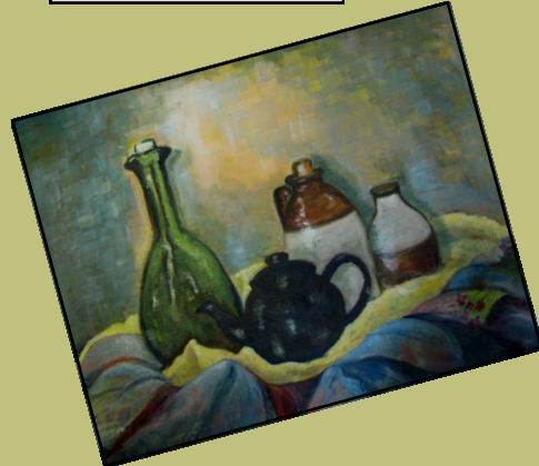
A few examples of my students work in both oils and watercolours